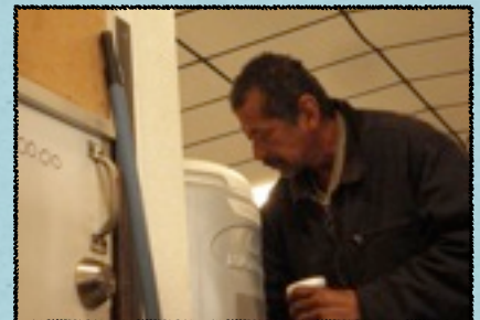
A HOMELESS MAN gets a cup of cold water.