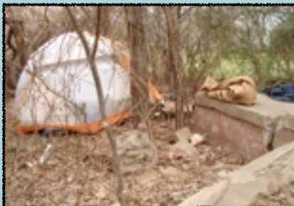
TWO OF OUR CARETAKERS lived her for over three years. We've helped them get off the street.

Our work demands a community of partners. We're pleased the employees of Bell/ Textron are with us.