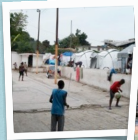
CFR Basketball Courts - Near Port-au-Prince, Haiti

* St. Pierre Basketball Court,-- near Port-au-Prince, Haiti